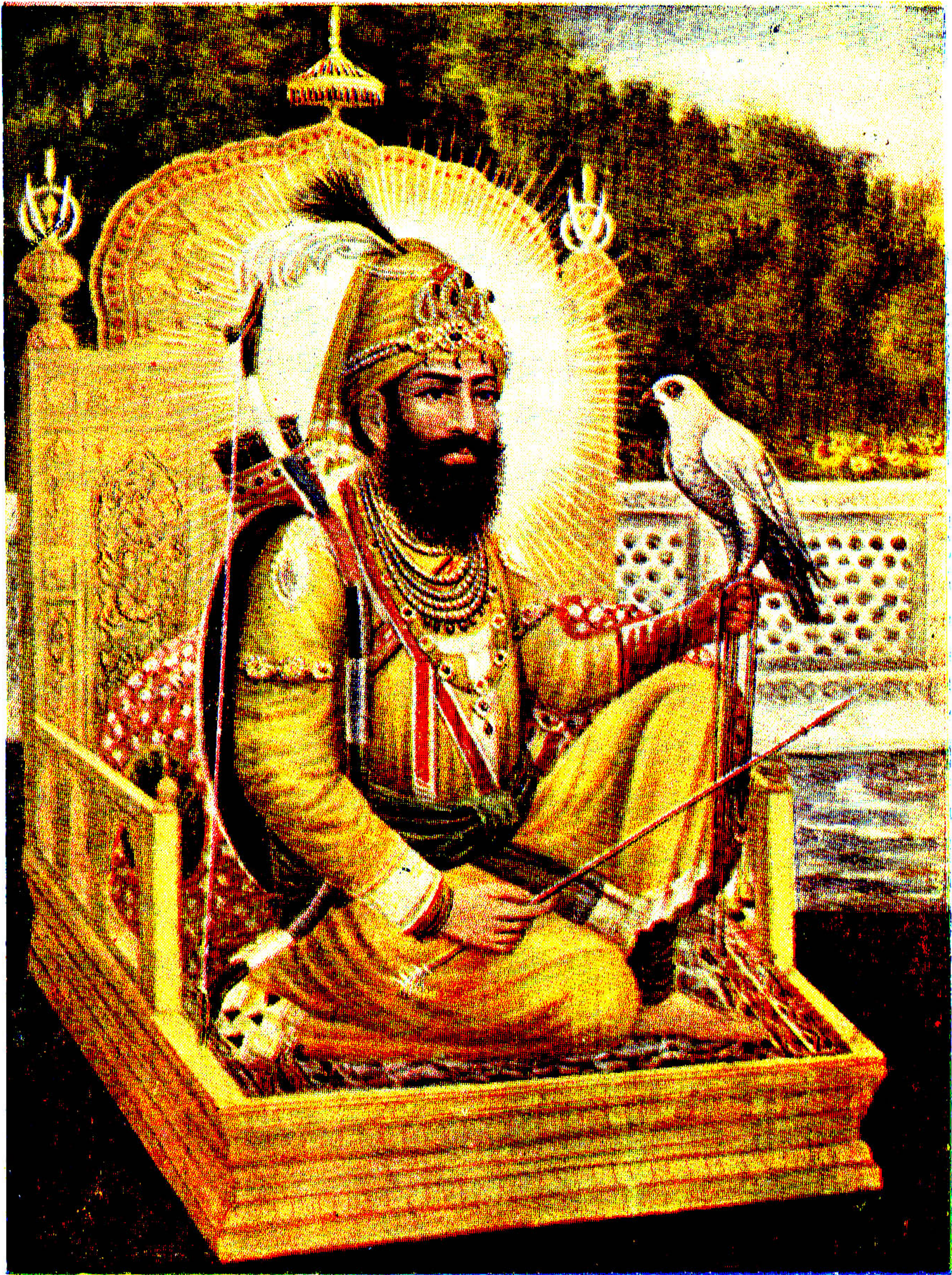
GURU GOBIND SINGH JI.